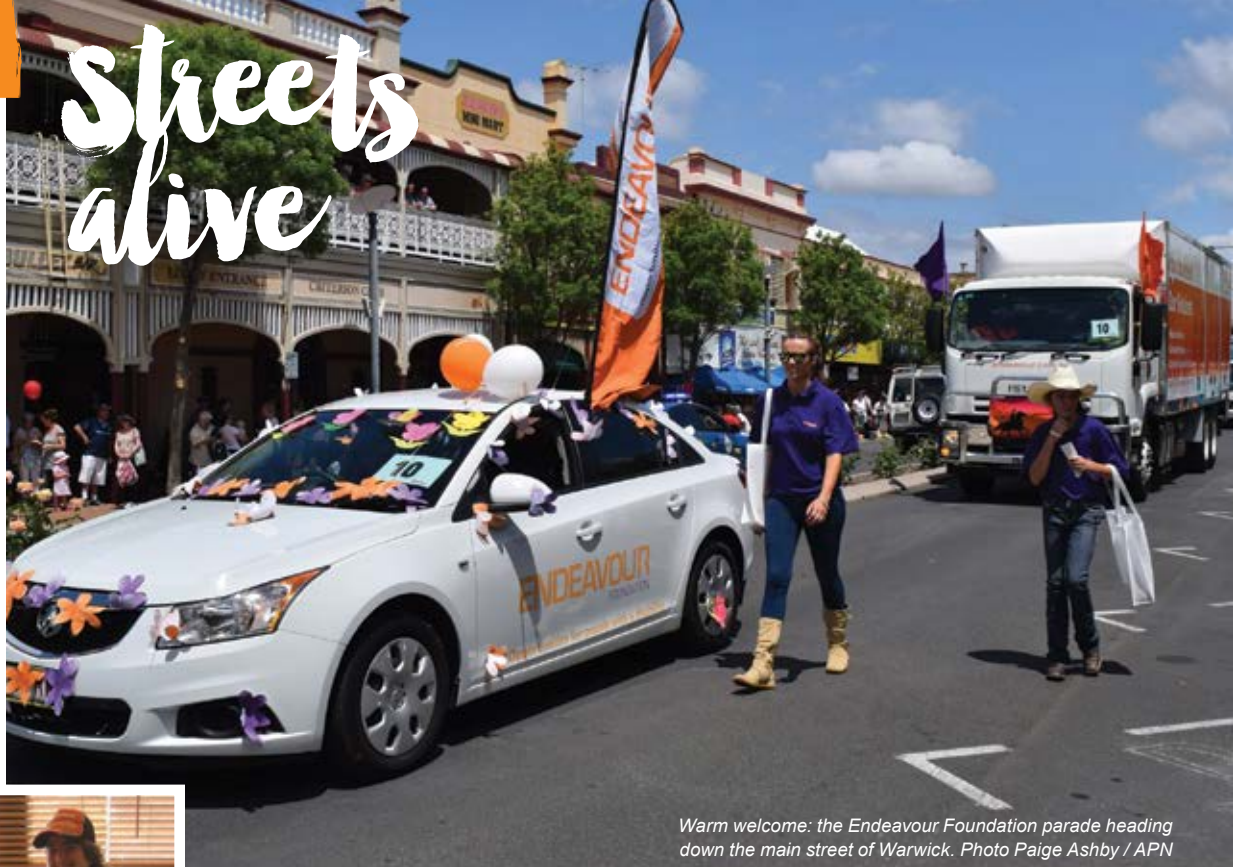
Warm welcome: the Endeavour Foundation parade heading down the main street of Warwick.