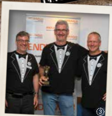
2015 Highest Fundraiser Car 1978 'The Love boat'