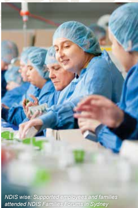
NDIS wise: Supported employees and families attended NDIS Families Forums in Sydney

"Distance and travelling time can be a challenge in Sydney, so we tried to provide a number of options and opportunities for people to hear more people about the NDIS, what it means to them, and our preparations for its introduction," he said.