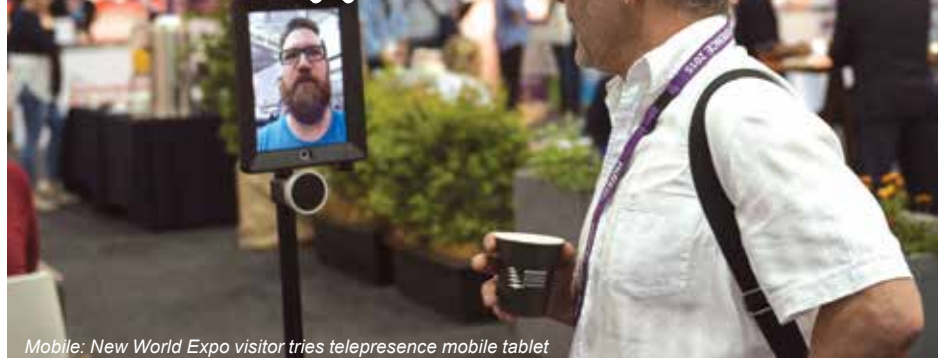
Mobile: New World Expo visitor tries telepresence mobile tablet