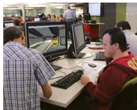
Virtual learning: Catching the train is made easier