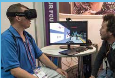
Visionary: Trying out the Endeavour Foundation virtual learning environment

During the New World conference, the National Disability Insurance Agency released its national strategy on Assistive Technology, together with its strategic priorities. Information about the strategy is available on the NDIS website ndis.gov.au