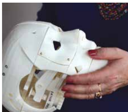
3D printed avatar helps children go places virtually

For more information about assistive technology including workshops and apps: endeavour.com.au/Disability-services/Resources